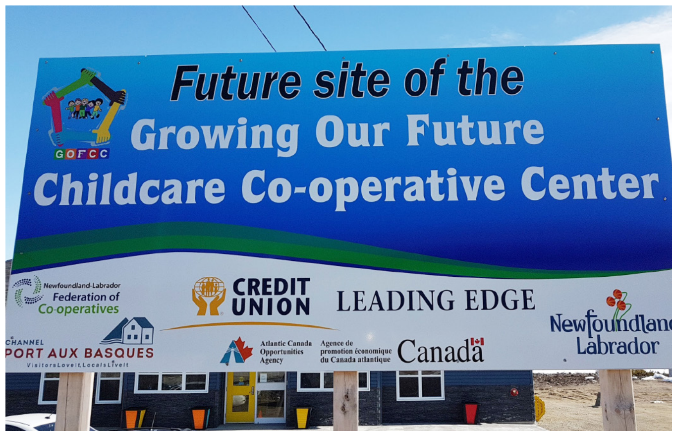
Photo: Growing Our Future Childcare Co-operative Center

Local institutions and industry groups, such as Memorial University's Centre for Social Enterprise, College of the North Atlantic, Community Business Development Corporations, Community Sector Council of Newfoundland and Labrador, TCII and Newfoundland and Labrador Federation of Co-operatives offer some business development training throughout the province. There is opportunity to build upon these offerings and support groups in new areas of social innovation.